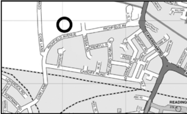
Rivermead Leisure Centre, Richfield Avenue, Reading, RG1 8EQ (0118 901 5000)